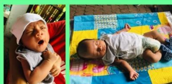
Cherished Child: His family arrived in this sheltered community one month before he was born. Now they have food, shelter and a community who care—a future.