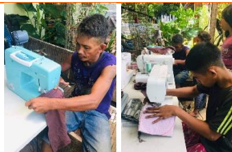
Men on Machines

They have a government contract to make blocks, but the challenge is transporting blocks to the required location. If anyone has suggestions on how to solve this, please let us know. $10,000 is needed to purchase second-hand truck. The truck can also be used to transport people to seek medical assistance. Unfortunately, if they do go to the doctor they must pay for consultation plus the cost of PPE for doctor. Hence, they are not seeking medical assistance.